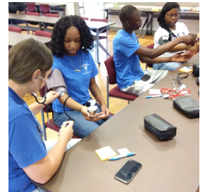
Summer Enrichment Opportunities