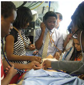
Regional Health Careers Academies