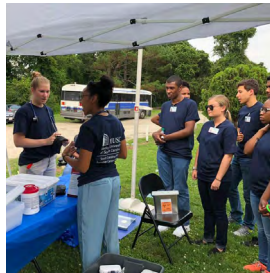
Community Service Projects